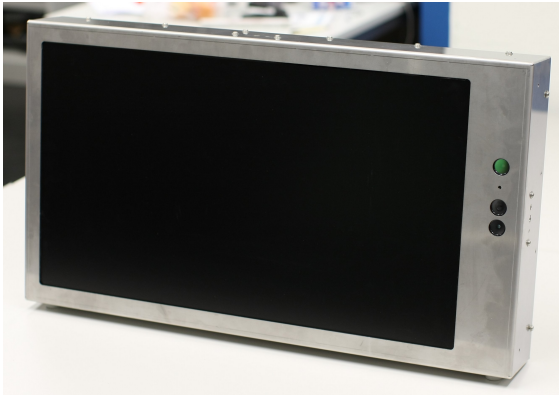
(a) A dual layer parallax barrier based automultiscopic display. Each layer consists of a LCD panel. The front layer is used as barrier, the back layer as image generator.