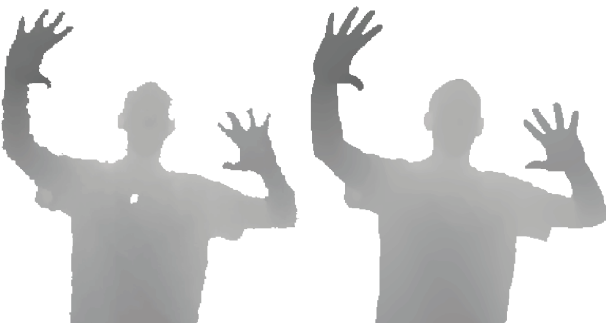
Figure 2: Depth map before and after processing

replaces the low quality RGB camera of the Kinect. Following [9], we perform denoising, outlier removal and foreground/background segmentation on the depth data in real-time, where the segmentation is used to mask out the captured person for further processing. Our algorithms all incorporate both color and depth information to align depth discontinuities of the output geometry with color edges in the video footage. An example of a depth map before and after processing can be seen in Figure 2.