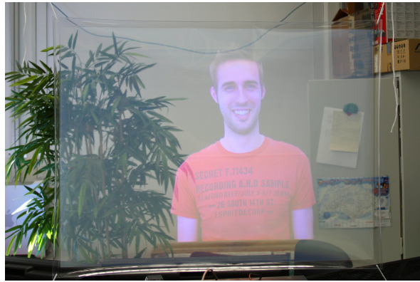
(b) Illustration of a stereoscopic projection on an anisotropic transparent backprojection foil. Content can be shown in 3D using nVidia 3D Vision and shutter glasses.