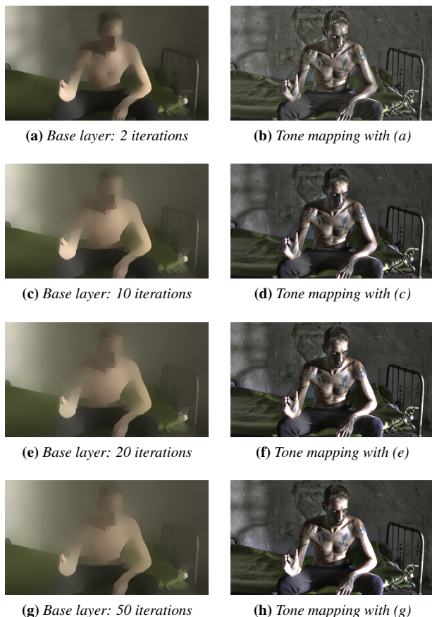
Figure 1: Impact of the number of iterations on the base layer and the tone mapping result. All results are created with our method with parameters \alpha = 2 , \sigma = 0.2 , and \lambda = 1 . The number of iterations varies.

We show different filtering and tone mapping results created with the help of our filter using different number of iterations, while the other parameters are fixed.