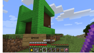
Figure 6: A compass provided by DiviningRod showing the distance (1 meter) to a player-created sign.